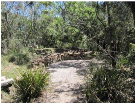
Seating in the Aub Luck Reserve

Wander along the bush paths and sit on the stone seat, listening to the birds. The reserve has entrances off Joyce Street, Taroon Street and Dumbleton Street. The Taroon Street entrance has recently been redesigned and is well worth a visit.