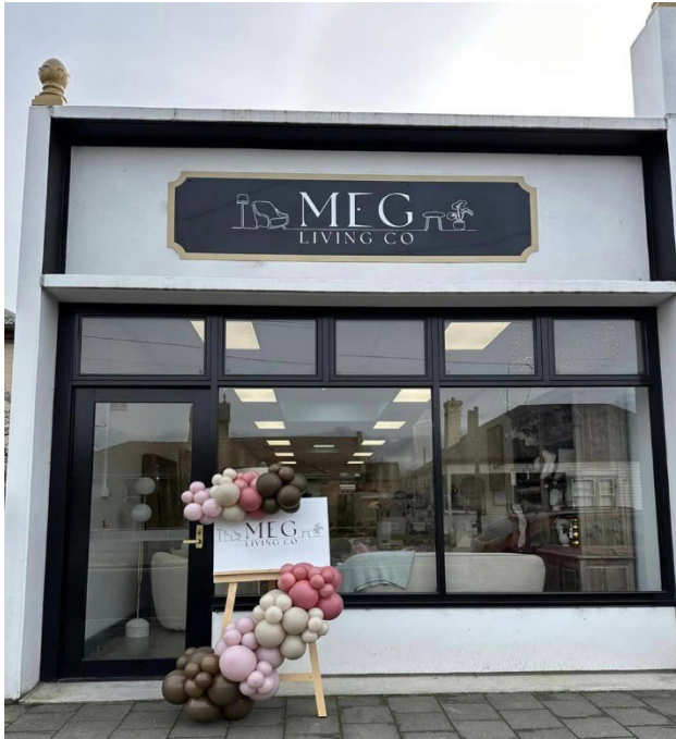
MEG Living Co Providing furniture and homewares at 1/135 Gilbert Street.