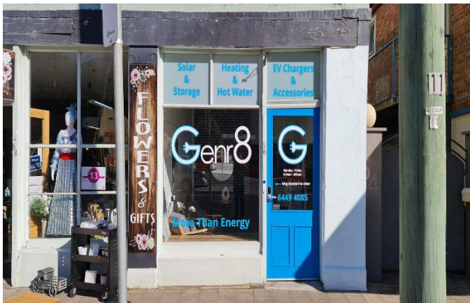
Genr8 Expert advice on energy solutions and future projects. 56 Gilbert Street.