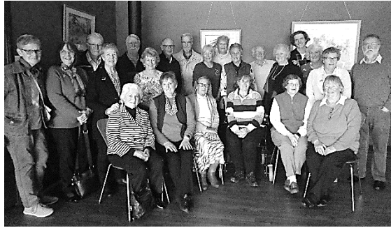
Pictured: Members of the Latrobe Croquet Club at their recent birthday celebrations.

The Latrobe Croquet Club celebrated its 5 th birthday in May with a lunch at Villarett Gardens.