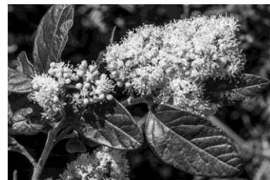
Lemon dogwood, a threatened plant that grows in the Aub Luck Reserve.

For example, there are two threatened plant species in the Aub Luck Reserve at Hawley. One is the sticky sword sedge, Lepidosperma viscidum , a very ordinary looking, knee high sedge whose strap like leaves have sticky, sharp edges. Its specialised habitat is