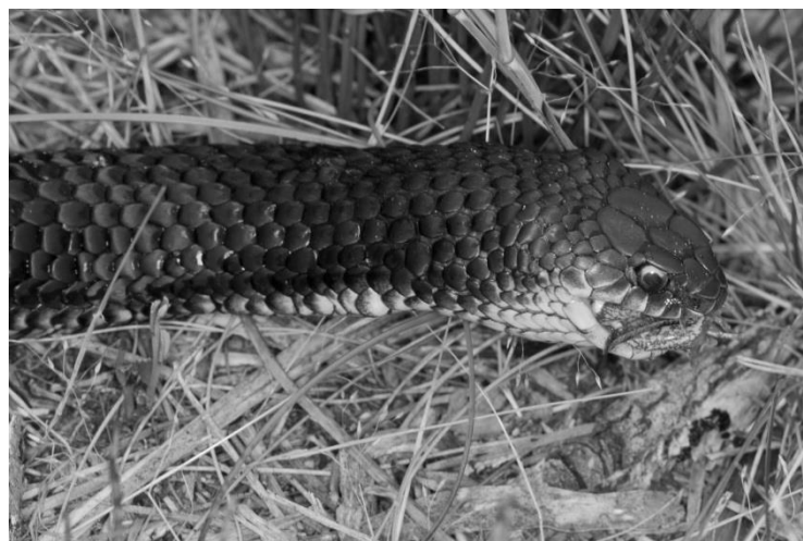
A copperhead eating a pobblebonk frog.

most important thing to do to avoid a bite is to leave snakes alone."