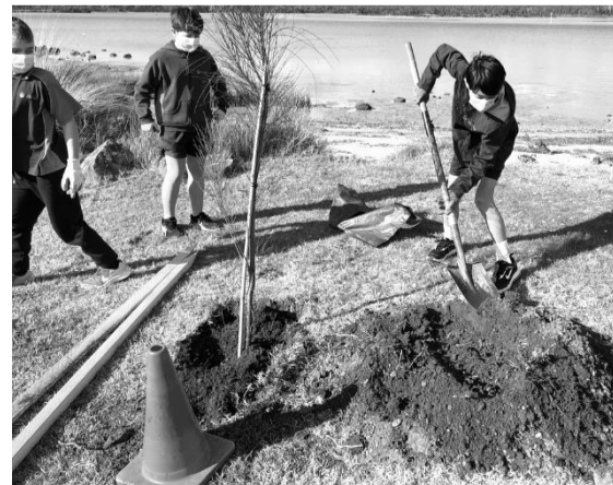
Pictured: Students of Port Sorell Primary School planting Larry the tree.

Latrobe Council's Tree Committee hopes to extend the day in 2023 to include other schools within the Latrobe Council area.