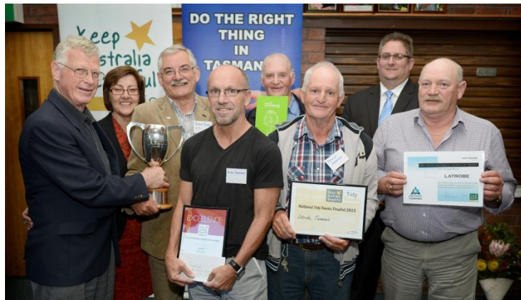
The Latrobe delegation receiving the town of Latrobe's Tasmanian Sustainable Communities/Tidy Towns Award from sponsors

The town of Latrobe was recently awarded the Tasmanian Title of Sustainable Community/Tidy Towns 2012-13.