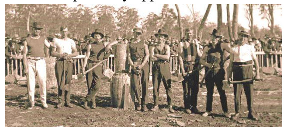
Pictured: Eight Woodchoppers posing with their axes, watched by crowd at competition, Waratah c1913-20. Nitrate sheet film negative. Purchased, 1984. Q1984.172

The Australian Axeman's Hall of Fame is open Tuesday to Sunday from 11:00 am until 2:00 pm or by appointment.