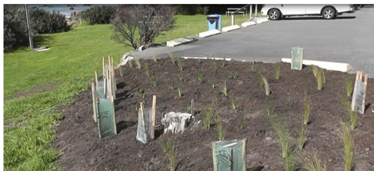
BACK TO GRASS ROOTS: Newly planted grasses on the Hawley foreshore.

Finally, the club also conducts BBQs in front of Coles in Devonport on many weekends. If you see the crew there, stop and buy a sausage.