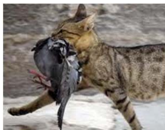
CAT-ASTROPHE: A bird in the bush is worth two in the mouth

Rubicon Reserve Pitcairn Reserve Aub Luck Reserve Panatana Park Camp Banksia Port Sorell Transfer Station