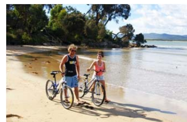
ON GOLDEN BEACHES: Port Sorell and Latrobe are part of an interstate tourism campaign

The Latrobe and Port Sorell Tourism Association, Latrobe Council, Kentish Council and individual operators have partnered with the North-West Regional Tourism Organisation (part of Cradle