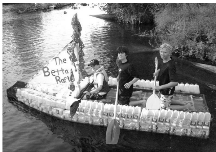
A Betta Boat entry this year

Entrants are required to construct a boat, defined as "a vessel for transport by water, constructed to provide buoyancy by excluding water and shaped to give stability and permit propulsion". This boat is to be primarily constructed from Betta Milk containers (refer to rules).